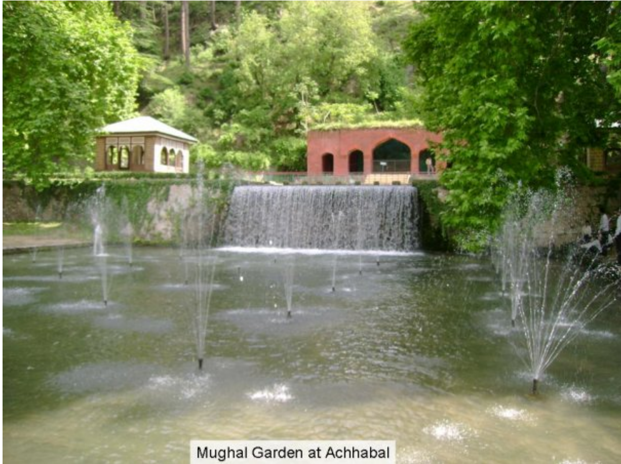
Mughal Garden at Achhabal